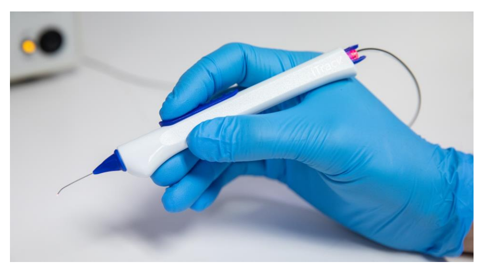
Figure 2: iTrack™ Advance canaloplasty device